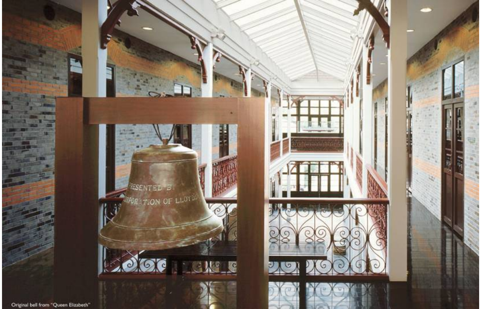
Original bell from "Queen Elizabeth"